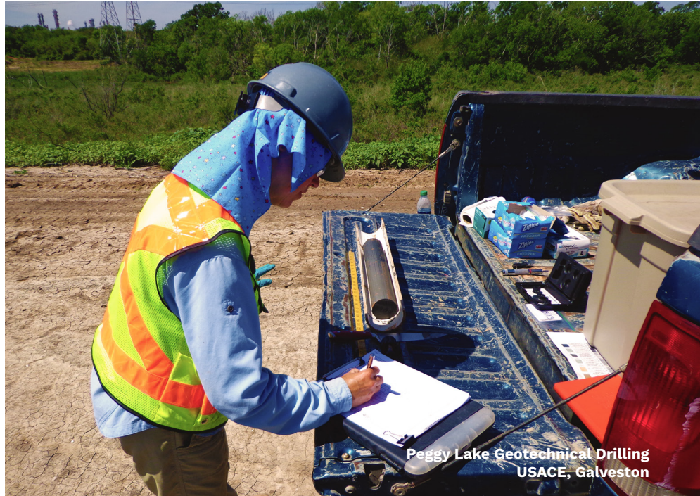
Peggy Lake Geotechnical Drilling USACE, Galveston