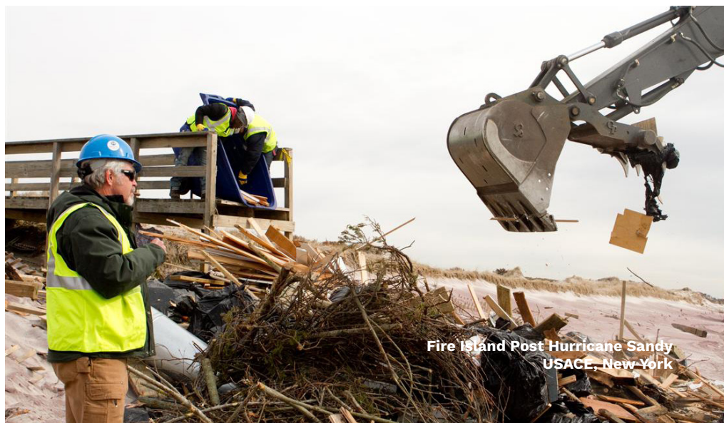
Fire Island Post Hurricane Sandy USACE, New York