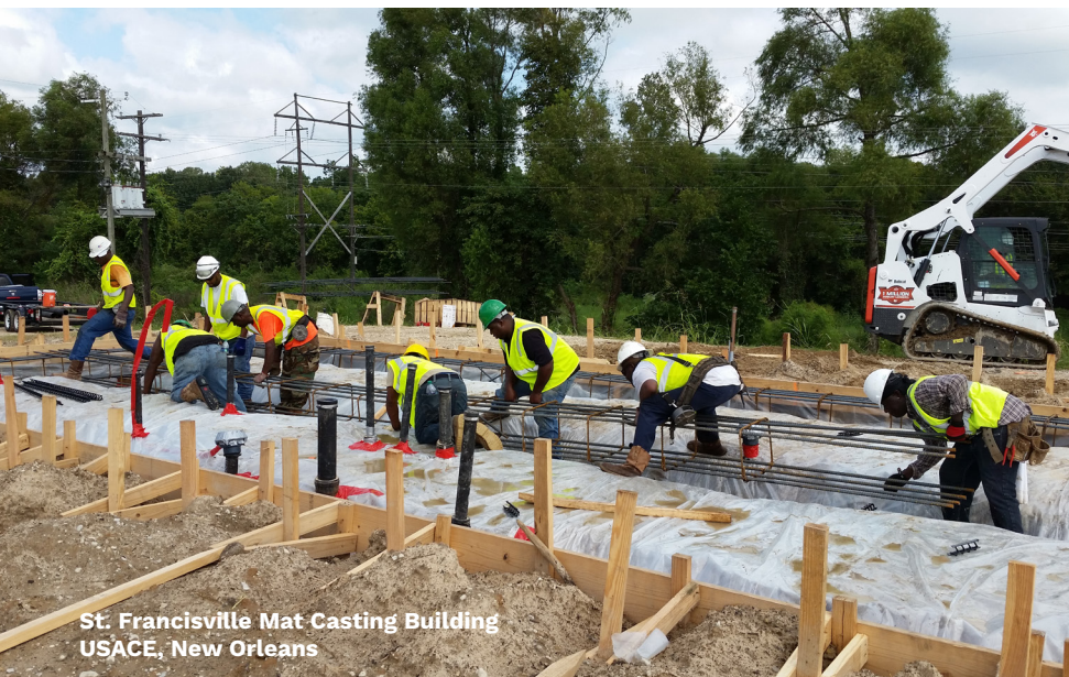
St. Francisville Mat Casting Building USACE, New Orleans