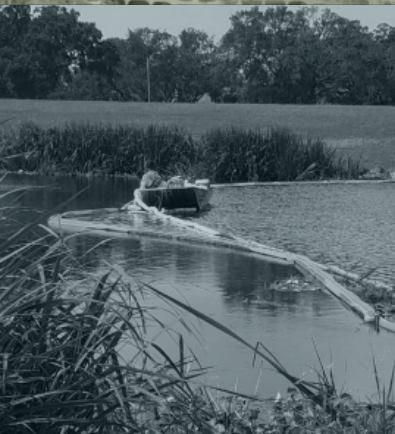
Canal Boom Maintenance & Emergency Response

QRI was awarded a $3.8 million contract with the USACE, Seattle District for the excavation, disposal and capping of soil in 123 residential yards containing arsenic and lead deposition in the Ruston neighborhood of Tacoma, Washington. Under the Comprehensive Environmental Response, Compensation, and Liability Act (CERCLA) and the Resource Conservation and Recovery Act (RCRA), the EPA (Environmental Protection Agency) issued a Record of Decision for the Ruston/North Tacoma Study Area in June 1993, selecting a remedy for soils in residential and public Right-of-Way (ROW) exceeding 230 parts per million (ppm) arsenic or 500 ppm lead. There were 1,800 contaminated yards due to the ASARCO Smelter located in the area from 1890 to 1985 with 1,624 yards having been remediated prior to QRI's contract.