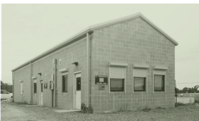
Mat Casting Yard

Asphalt & Concrete Parking Lot Installation Levee Construction & Repair Concrete & Structural Repair New Construction Demolition of Structures Relief Well Installation Ditching / Grading Remodeling & Additions Geotechnical Drilling Restorations & Renovations Hardening of Facilities Site Preparation Historical Restoration / Interpretative Design Heavy & Civil Engineering Construction Landscape Services