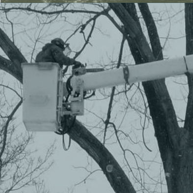
Personal Property Debris Removal

QRI managed the clearing, segregation, recycling, reduction and removal of generated debris in the ROW and on private property on Fire Island, New York following Hurricane Sandy. QRI mobilized $3.4 million of heavy equipment, including hopper and spud barges, to haul waste containers off of Fire Island. Debris removed consisted of approximately 1,177 cubic yards of vegetative debris and 3,823 tons of construction and demolition debris. QRI accomplished all debris removal activities within 32 days and successfully met a restrictive deadline.