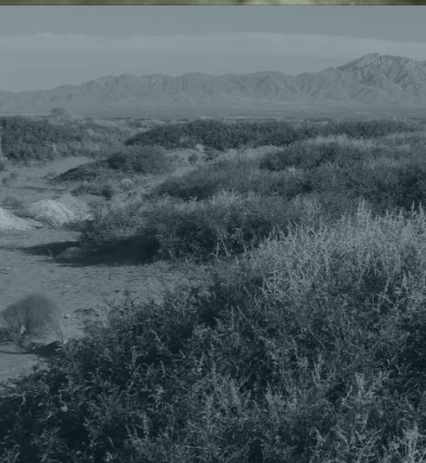
Cultural and Natural Resources Support

QRI has performed 102 ECS task orders under two Indefinite Delivery / Indefinite Quantity (IDIQ) contracts for the GSA, PBS in Region 7 – Louisiana, Texas, Oklahoma, Arkansas, and New Mexico. These services were performed at over 100 Federal properties and/or buildings across the 5-state Region. Several tasks were performed at U.S. Customs and Border Protection owned Ports of Entry. Task orders have involved several types of environmental studies and evaluations such as NEPA; natural and cultural resources; compliance; pollution prevention; mold, asbestos and lead surveys; air quality surveys; corrective action support; Geographic Information Systems (GIS) support; environmental training; and interaction with public and regulatory agencies.