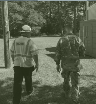
Haul and Install FEMA Mobile Housing Units

QRI was awarded a contract to construct a new, rigid-frame office building by the USACE, New Orleans District. This two-story, 2,176 square foot structure was built on a soil supported concrete slab on top of the levee located adjacent to the Port Allen Lock. The purpose of the building was to create a permanent commercial structure for the Port Allen Lock Master and his staff. It also doubles as a Visitor Center with an exhibit room showcasing the Lock and how it works, as well as being a hurricane shelter.