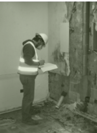
GSA Environmental Services IDIQ

QRI has performed 102 ECS task orders under two Indefinite Delivery / Indefinite Quantity (IDIQ) contracts for the GSA, PBS in Region 7 – Louisiana, Texas, Oklahoma, Arkansas, and New Mexico. These services were performed at over 100 Federal properties and/or buildings across the 5-state Region. Several tasks were performed at U.S. Customs and Border Protection owned Ports of Entry. Task orders have involved several types of environmental studies and evaluations such as NEPA; natural and cultural resources; compliance; pollution prevention; mold, asbestos and lead surveys; air quality surveys; corrective action support; Geographic Information Systems (GIS) support; environmental training; and interaction with public and regulatory agencies.