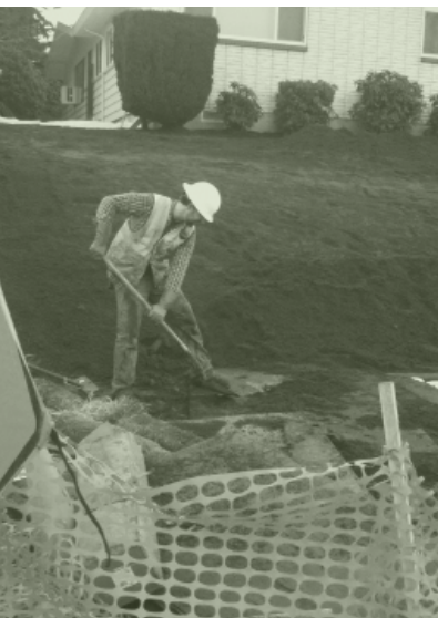
Superfund Site Remediation

Remedial Investigations & Field Studies Response Actions, Removals & Operations & Maintenance Soil / Groundwater Remediation Tank Battery Remediation Uniform Federal Policy for Quality Assurance Project Plans (UFP-QAPP)