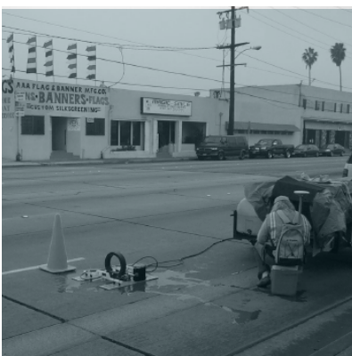
Subsurface Stratigraphy Survey

QRI defined the stratigraphy in the upper 100 feet on 56 acres in Hawthorne, California utilizing the Pulser™ Subsurface Survey System (Pulser™) in conjunction with existing databases. Previous lithologic studies presented chaotic bedding relationships that made it difficult to correlate from well to well. As a result, the Pulser™ technique was utilized to develop the stratigraphic framework for the site conceptual model. Pulser™ mapping non-intrusively delineated and refined stratigraphic units across the project site.