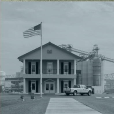
Lock Master Structure

QRI constructed a new, masonry office building designed by the USACE, New Orleans District. The 70' x 20' structure was supported by 44 H pilings with a reinforced supported concrete slab on top of the levee located adjacent to the St. Francisville Mat Casting Yard.