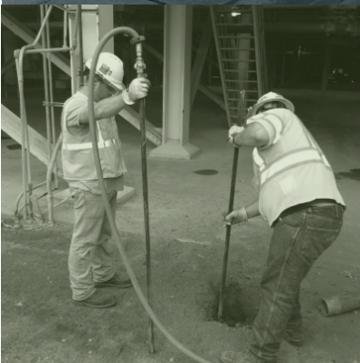
GPR, Utility Locating & Vacuum Excavation

QRI defined the stratigraphy in the upper 100 feet on 56 acres in Hawthorne, California utilizing the Pulser™ Subsurface Survey System (Pulser™) in conjunction with existing databases. Previous lithologic studies presented chaotic bedding relationships that made it difficult to correlate from well to well. As a result, the Pulser™ technique was utilized to develop the stratigraphic framework for the site conceptual model. Pulser™ mapping non-intrusively delineated and refined stratigraphic units across the project site.