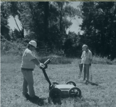
GPR & EM Surveys at Historical Sites

QRI provided GPR, EM utility locators, and air knife/vacuum excavation services at 33 retail gasoline distribution sites in the New Orleans and Baton Rouge areas. This utility clearance protocol was a required safety measure performed prior to environmental drilling activities. QRI cleared over 350 boreholes on schedule and with zero lost time.