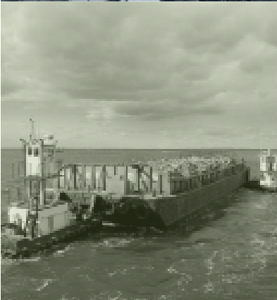
Debris Removal, Haul & Disposal Services

Following Hurricane Gustav, QRI was awarded a debris monitoring contract by the Baton Rouge Recreation & Park Commission (BREC) for quality assurance monitoring and documentation to meet the Federal Emergency Management Agency's (FEMA) reimbursement eligibility guidelines. QRI successfully completed monitoring and documentation of the removal and disposal of 80,873 yards of storm-related debris from 185 BREC parks. QRI achieved 100% FEMA documentation compliance resulting in the maximum reimbursement for BREC.