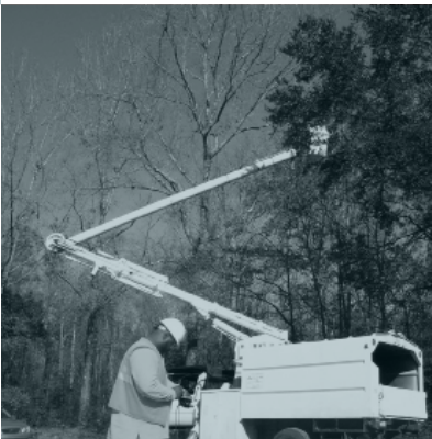
Debris Removal Monitoring

Emergency Spill Response Quality Assurance & Control